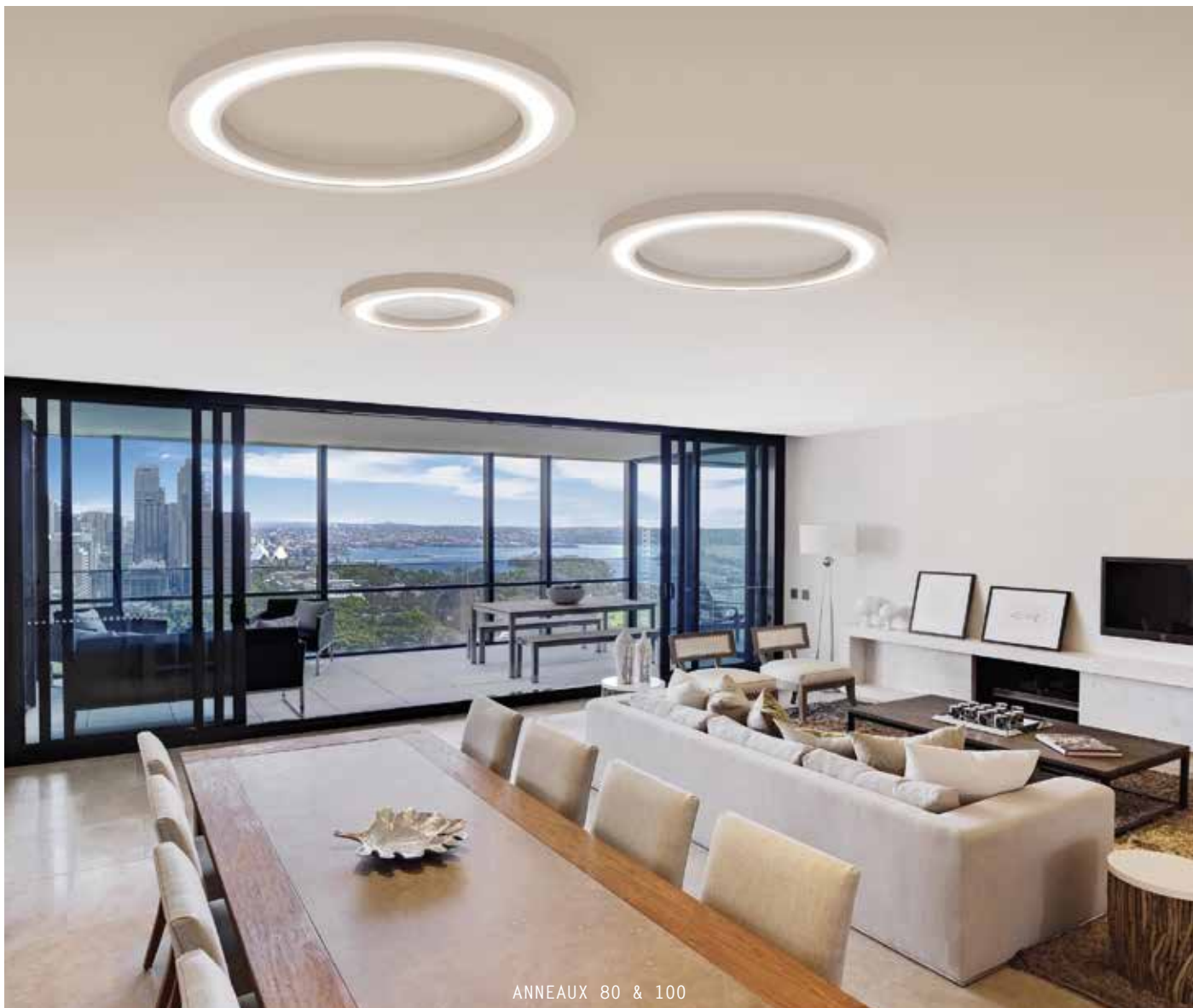
ANNEAUX 80 & 100